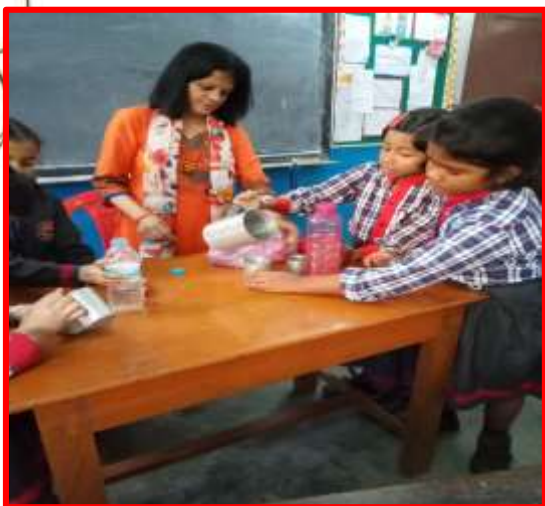
MAKING MEASURING BOTTLE