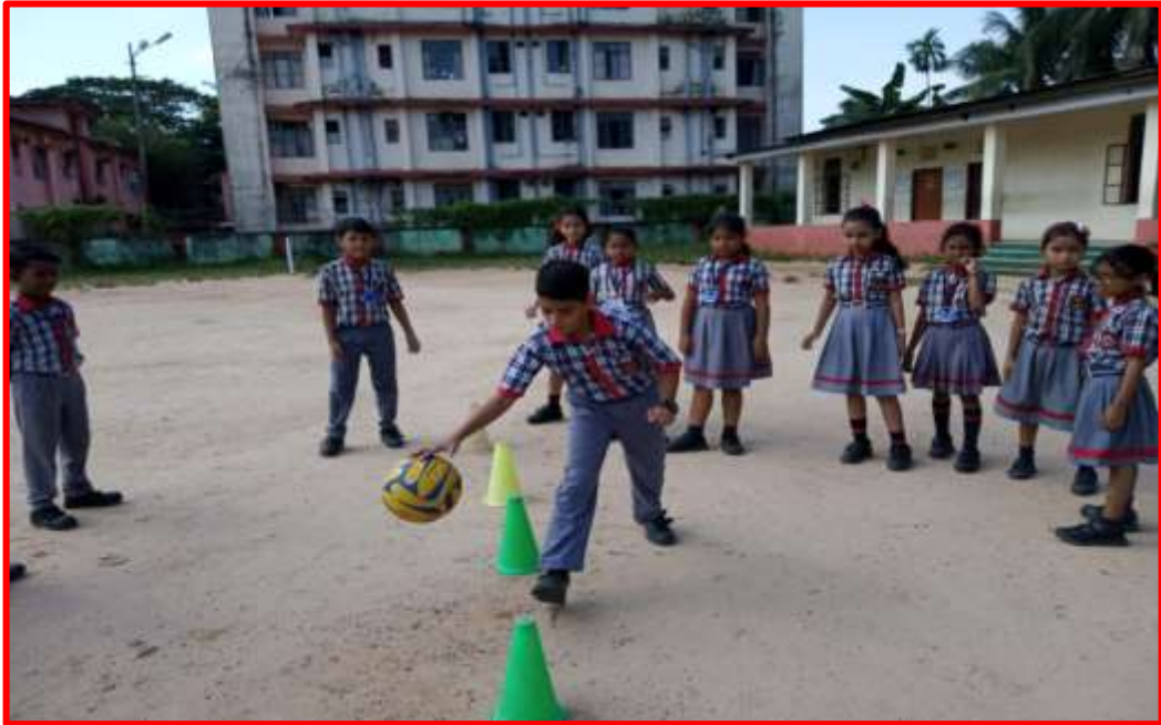
DRIBBLING WITH HANDS BOYS