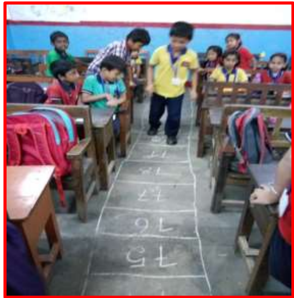
DEVELOPED THE CONCEPT OF SKIP COUNTING