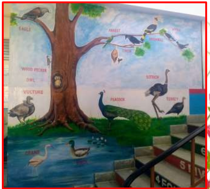
DIFFERENT BIRDS SPECIES