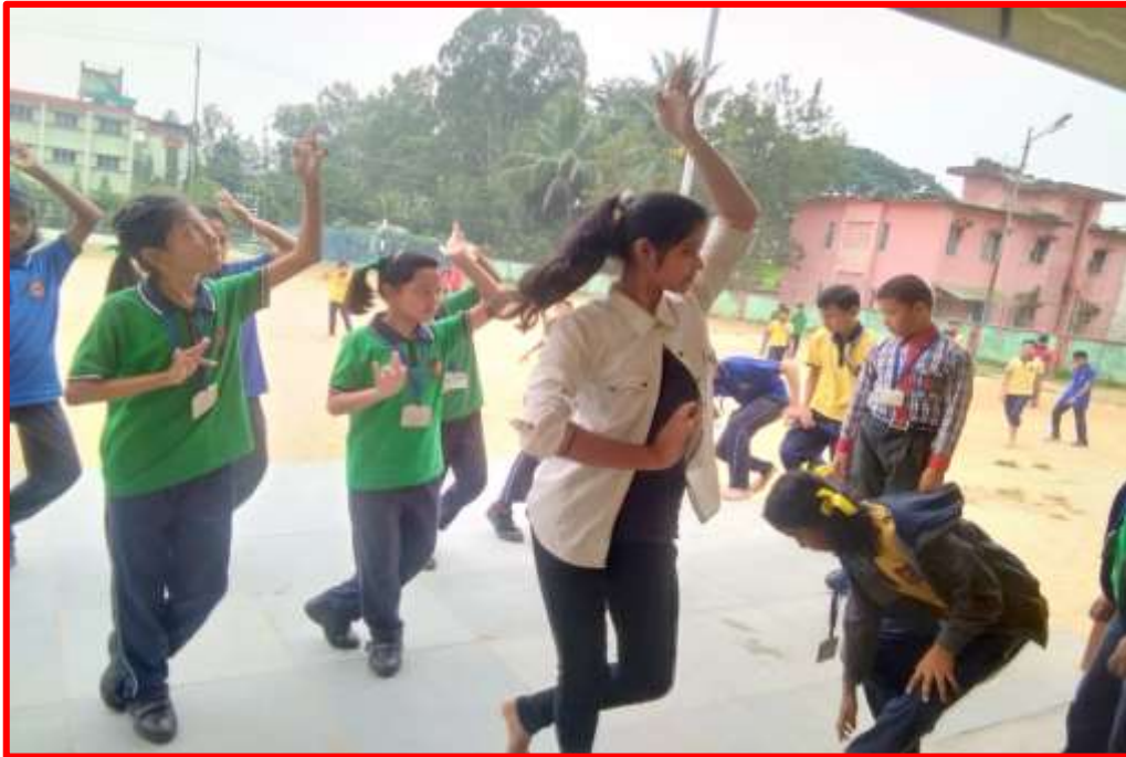
CHILDREN PRACTISING DANCE WITH THE EXPERT