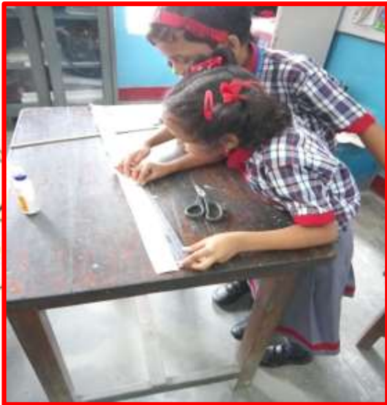
CHILDREN MAKING METRE TAPE