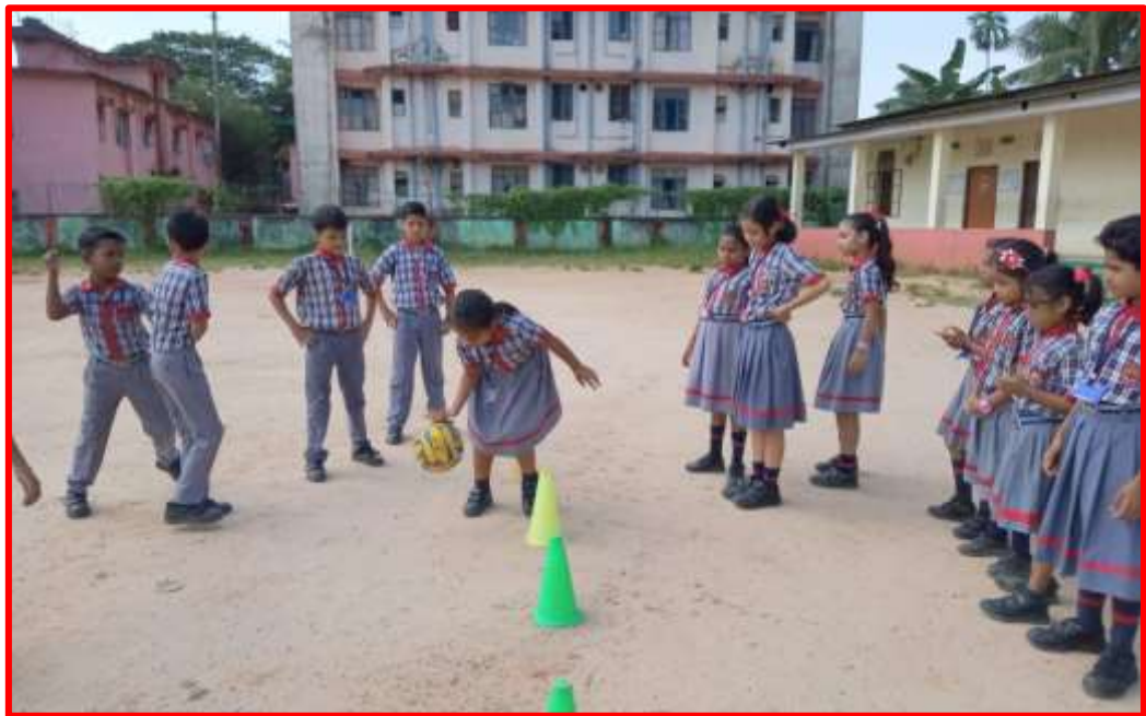
DRIBBLING WITH HANDS GIRLS