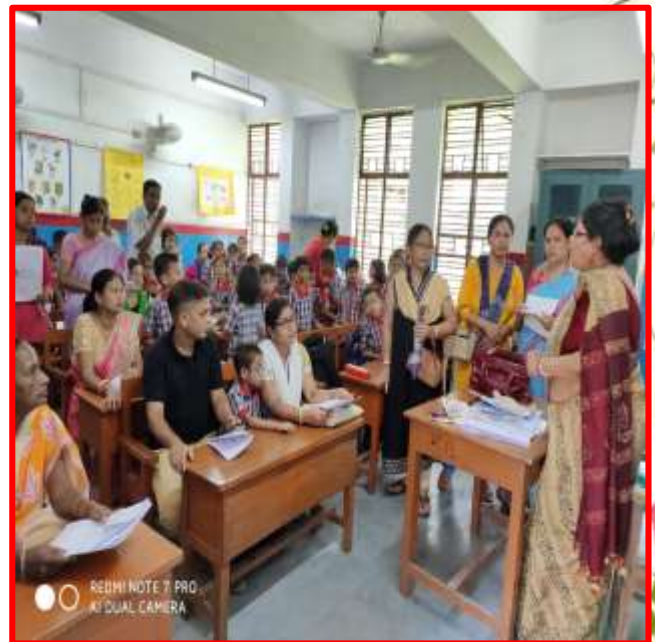
PARENTS MEETING FOR DENTAL CARE