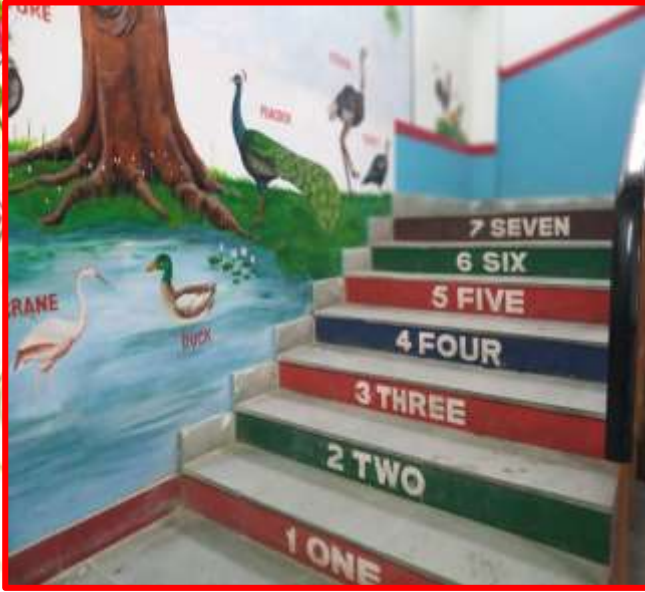
DEVELOPED THE CONCEPT OF ASCENDING AND DESCENDING ORDER