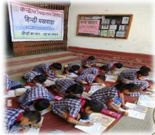
HINDI CALLIGRAPHY COMPETITION

A genuine smile comes from the heart, but a healthy smile needs good dental care