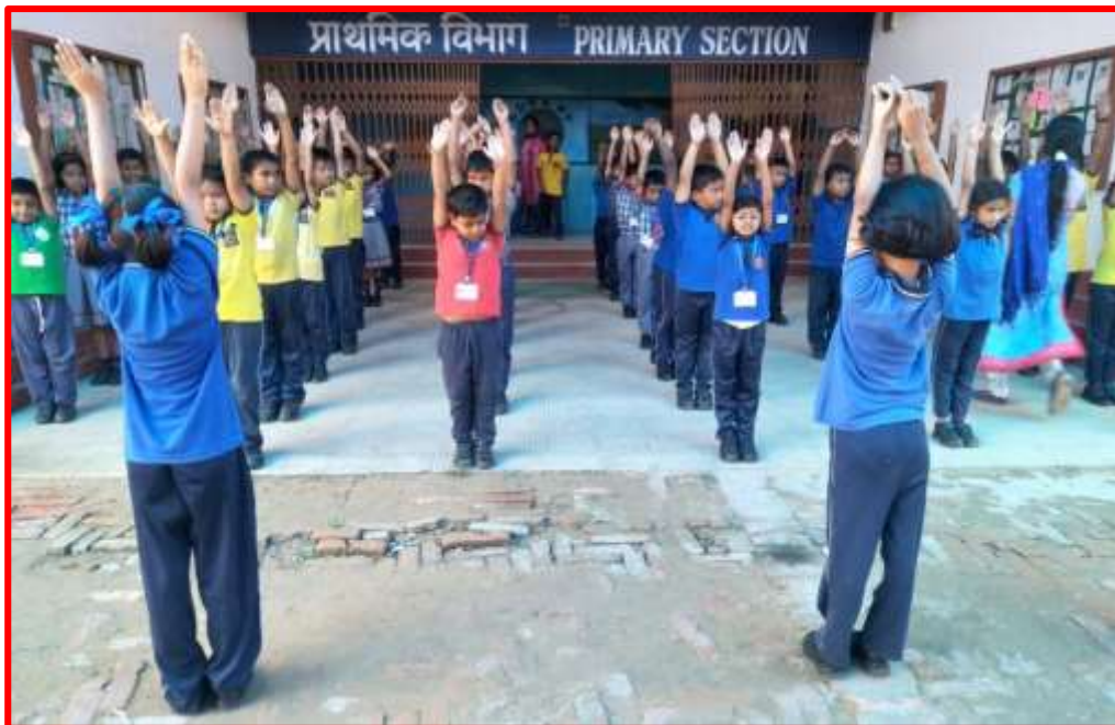
CHILDREN ENJOYING YOGA